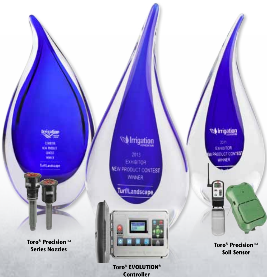
Toro® Precision™ Series Nozzles