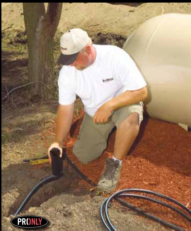
Simplified head installation

For quick, reliable connections trust the genuine article — the one and only Irritrol Super Blue Flex™ Pipe. With up to 120 psi pressure rating and a 5-year warranty, Super Blue Flex won't let you down. For flexibility you can trust, look for the true blue stripe!