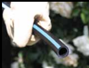
Strength and durability over time