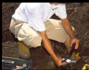
Conveniently unwinds from center

TRUE FLEXIBILITY, TRUE DURABILITY, TRUE BLUE!